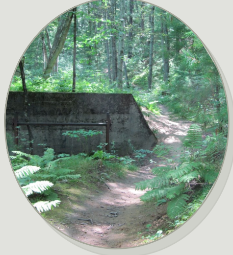
Target # 2