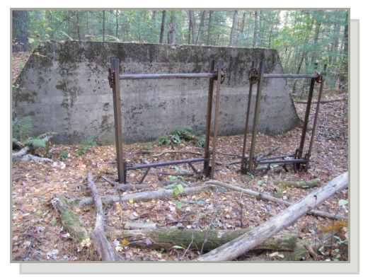
Target #3: 600 Yard

The range included targets mounted behind four abutments at intervals of 200, 300, 600, and 1,000 yards.