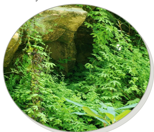
The Climbing Fern (Lygodium palmatum)

Ministerial Swamp gets its name from the tract it is part of, a wood lot originally set aside in the 1600s for the ministers of First Parish Church. The canopy of mixed birch, aspen, pine, and oak at the Old Marlborough Road entrance is bordered on the north by this swampy land. While similar to other acid bogs in the area, Ministerial Swamp is unique for its association with a rare climbing fern (Lygodium palmatum) first discovered here in 1851 by Henry David Thoreau who surveyed the area. He described it as an unusual fern that is an evergreen, ivy-like plant that grows along the ground in woods within the swamp and climbs 3 to 5 feet up other plants. It is the only fern in New England that twines like a vine and is very rare. The New England Wildflower Society included the Ministerial Swamp fern in its 2009 field study of rare plants, citing its importance in an environment of rapid habitat degradation from development and invasive species, though it has not been observed at the Old Rifle Range in recent years.