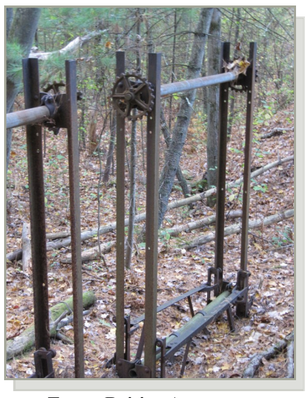
Target Raising Apparatus

Target Trail - The Main trail from Old Marlborough Road straight through to Kennedy's Pond offers the full experience of the Rifle Range Conservation Land, passing the four old rifle range target berms before reaching the peaceful pond waterscape. Reverse direction back to the parking area. Walking time 30 minutes each way.