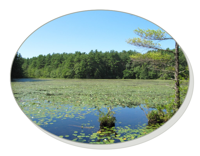
View of Kennedy's Pond from Old Rifle Range

Old Marlborough Road all the way down range to the farthest target at 1,000 yards distance.